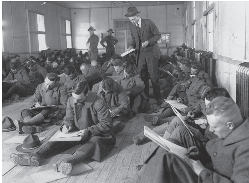
Figure 1.2 Group testing of US army recruits during the First World War

Wechsler developed his test for use in an adult inpatient psychiatric setting as an aid in differential diagnosis. A patient in this setting might present with symptoms of schizophrenia or alcoholism, or be of low general intelligence. Wechsler sought a test that would provide not just an overall assessment of intellectual level, but would also assist in identifying which possible diagnosis was the most likely. The use of the test for this purpose has been criticised, but it is clear that, as an individual test of general ability for adults, Wechsler's test was superior to the Stanford-Binet. Not only was the content more age appropriate, but Wechsler also replaced the mental age scoring method with the Deviation IQ method, which was based on earlier work by Godfrey and his team in Edinburgh (Vernon, 1979). The Deviation IQ method compared the performance of the individual with that of his or her age peers by dividing the difference between the individual's score and the mean for the peer group by the standard deviation of scores for the peer group. The idea was used in a subsequent revision of the Stanford-Binet (the LM revision) and continues to this day in both the Wechsler and the Binet tests.