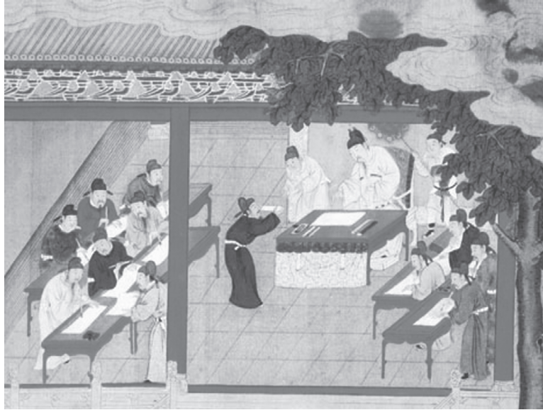
Figure 1.1 Imperial examination in China

version, which he termed the Stanford-Binet, which was to dominate as a test of intelligence for individuals until David Wechsler (1896–1981) published a test for the individual assessment of adult intelligence in 1948.