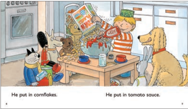
The Toys’ Party , Oxford Level 2.

Discover the benefits of using Oxford Levels on page 12–13.