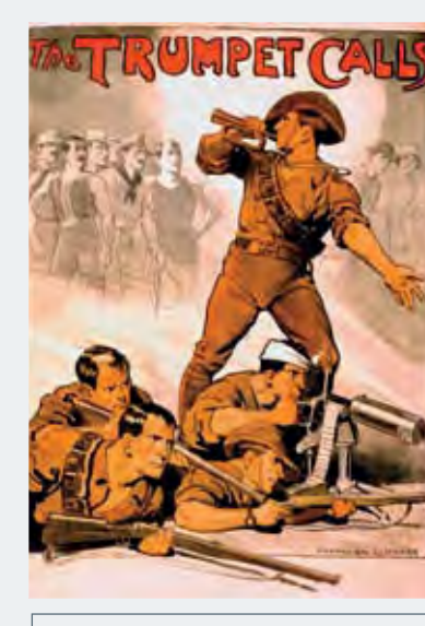
Source HT.5 This propaganda poster from World War I encouraged Australia men to serve their country overseas rather than stay home in Australia.

(change). During World War I, the vast majority of propaganda took the form of printed posters that were displayed on the streets and in workplaces (see Source HT.5). Although printed posters were also important during World War II (continuity), a far greater percentage of propaganda at that time was delivered in the form of moving pictures known as newsreels (change). Newsreels were produced by governments with the goal of boosting morale for Australians at home, and were even sent to troops fighting overseas to lift their spirits. One newsreel of Australian troops on the Kokoda Trail, called Kokoda front line! , even won the Oscar for best documentary in 1942 (see Source HT.6).