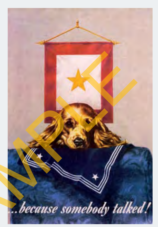
Source HT.15 World War II poster (AWM ARTV09225) Source HT.16 World War II poster (AWM ARTV00047)