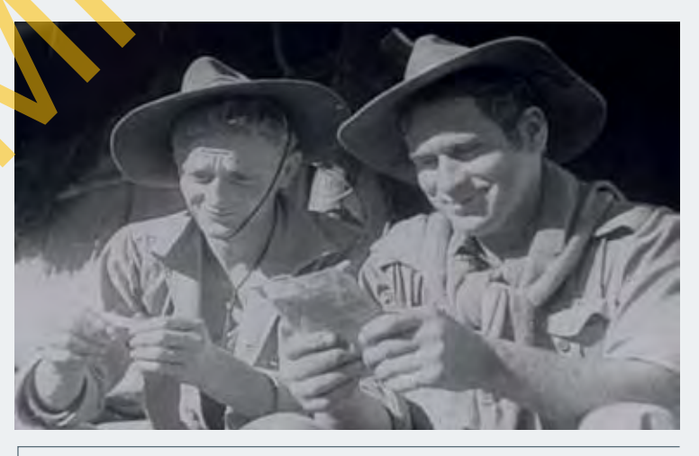
Source HT.6 A still from an Oscar winner newsreel Kokoda front line! shows Australian soldiers happy to receive letters from home. Newsreels were effective forms of propaganda in Australia during World War II