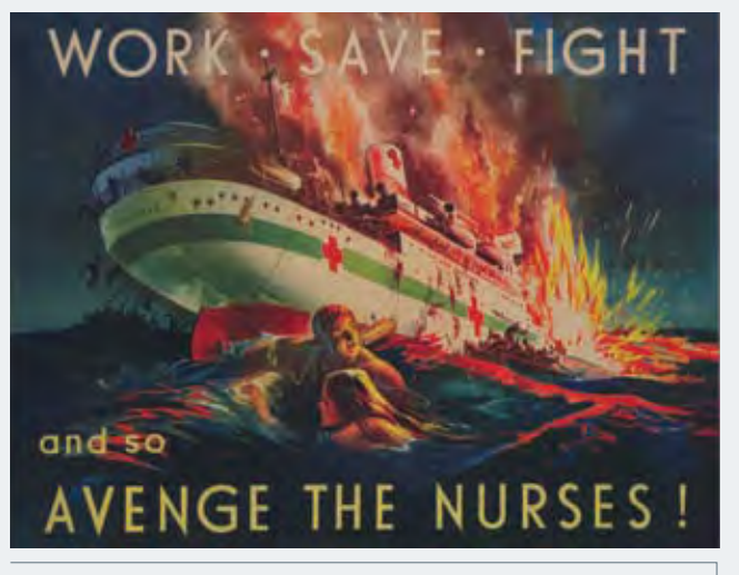
Source HT.14 A poster issued by the Australian government in 1943 (AWM ART V09088)

ship AHS Centaur in May 1943. It was torpedoed off the Queensland coast by a Japanese submarine. The ship exploded and sank within minutes and only 64 of the 332 passengers and crew were rescued.