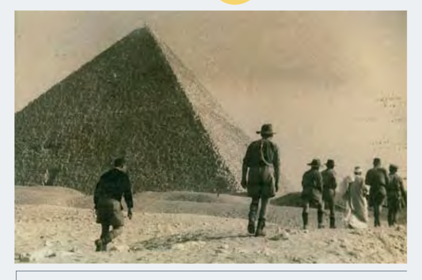
Source HT.18 Australian infantry forces during training in World War II