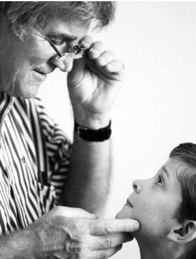
Source 4 Fred Hollows is known for working with people around the world to restore eyesight of those who could not access corrective surgery otherwise.

A citizen may also act on a global level to make the world a better place to live in. The late Fred Hollows is an example of a citizen who used his skills to restore eyesight to thousands of people in Australia and in many other countries around the world.