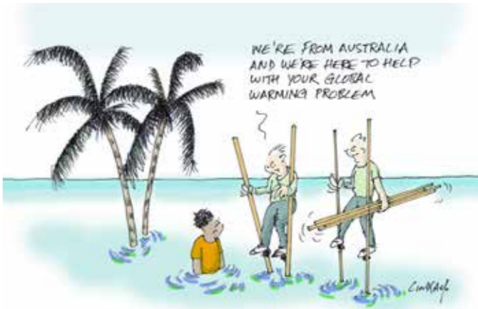
Source 1 Cartoonists present their viewpoints on current issues using images and humour.

Active citizens ask lots of questions. Often they don’t believe everything they read and they seek to detect the motivation behind why someone takes a certain point of view or acts in a certain way. For example, when they see politicians talking in the media they listen to their arguments and seek out differing points of view. They also check facts and look at the arguments for and against a certain issue before reaching their own conclusions. When active and informed citizens state their own viewpoint, they support this with evidence such as statistics, cases from the past, quotes from relevant sources and sound reasoning.