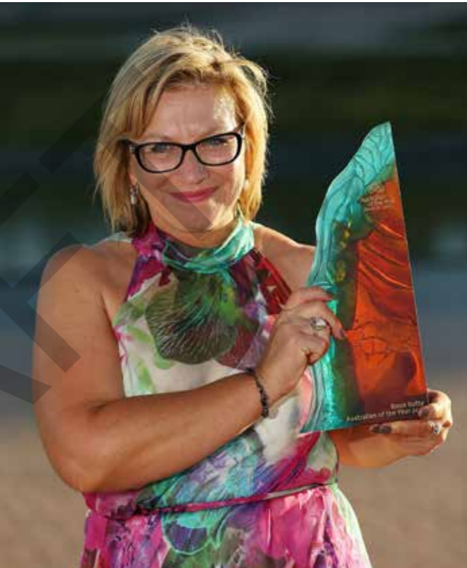
Source 3 In 2015 Rosie Batty was appointed Australian of the Year for her work in educating people about the impact of domestic violence and her involvement in establishing the Royal Commission into Family Violence in Victoria.