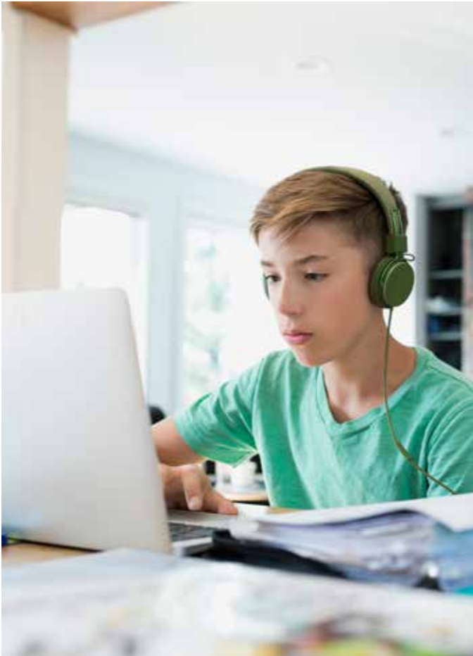
Source 2 You need to ensure that sources of information gathered online are accurate and reliable.

Although books and newspapers are valuable sources of information, most research today is conducted online. In order to ensure that sources gathered online are accurate, reliable and relevant, a number of guidelines should be followed: