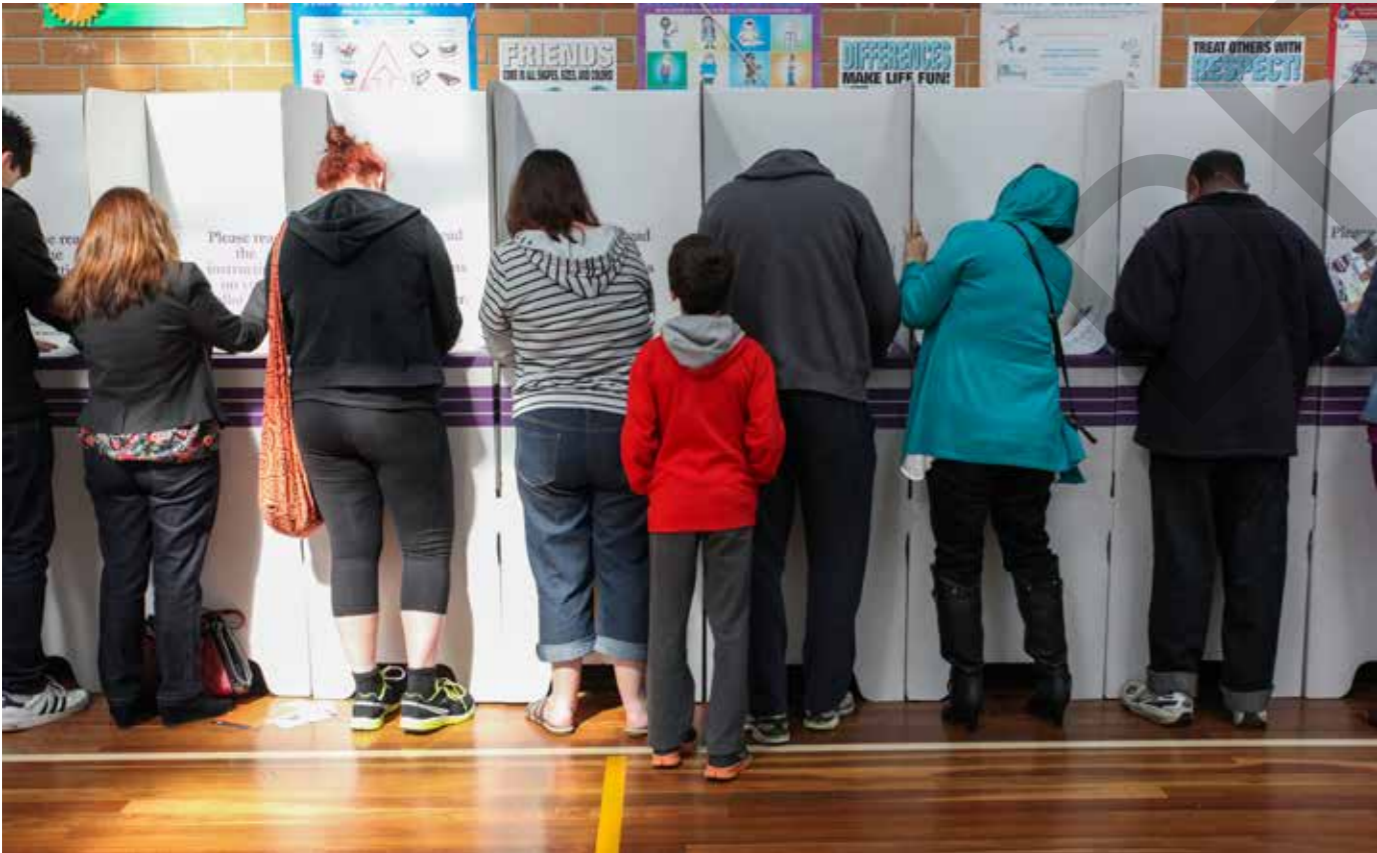
Source 2 Australian citizens are legally required to vote in both state and federal elections