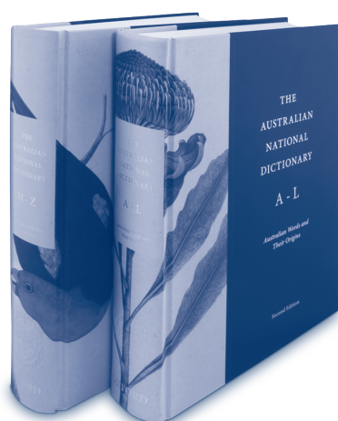
STANDARD EDITION 9780195550269 • $175.00