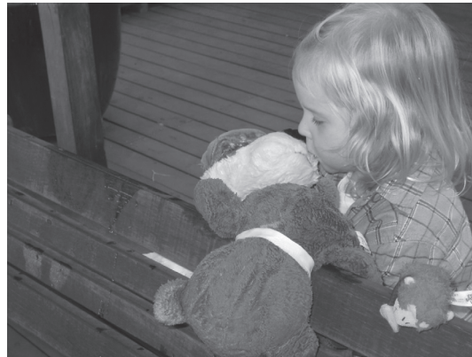
Figure 1.3 A girl is tenderly kissing her favourite teddy, who has become a real person to her