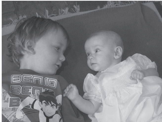
Figure 1.8 Communication occurs at an early age