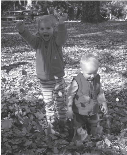
Figure 1.1 Fallen leaves become a plaything