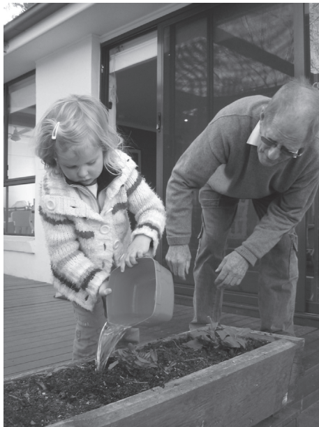
Figure 1.5a and 1.5b Children and their grandfathers—intergenerational teaching and learning

Figures 1.5a and 1.5b (showing two different interactions between young children and their grandparents) illustrate Piaget's and Vygotsky's principles of play-based learning in action. Fantasy play is a prominent play activity in Vygotsky's theory; he granted it the status of a leading factor in development. Any discussion on children's intellectual development through play draws heavily on the pioneering work of Piaget and Vygotsky. The contribution that these theorists have made to our understanding of child development and play is monumental.