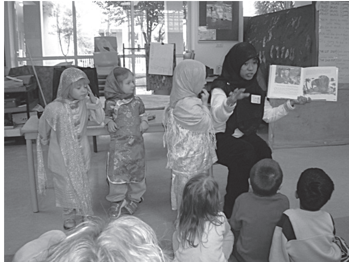
Figure 1.7 Playing with dress-ups or learning to respect cultural diversity?